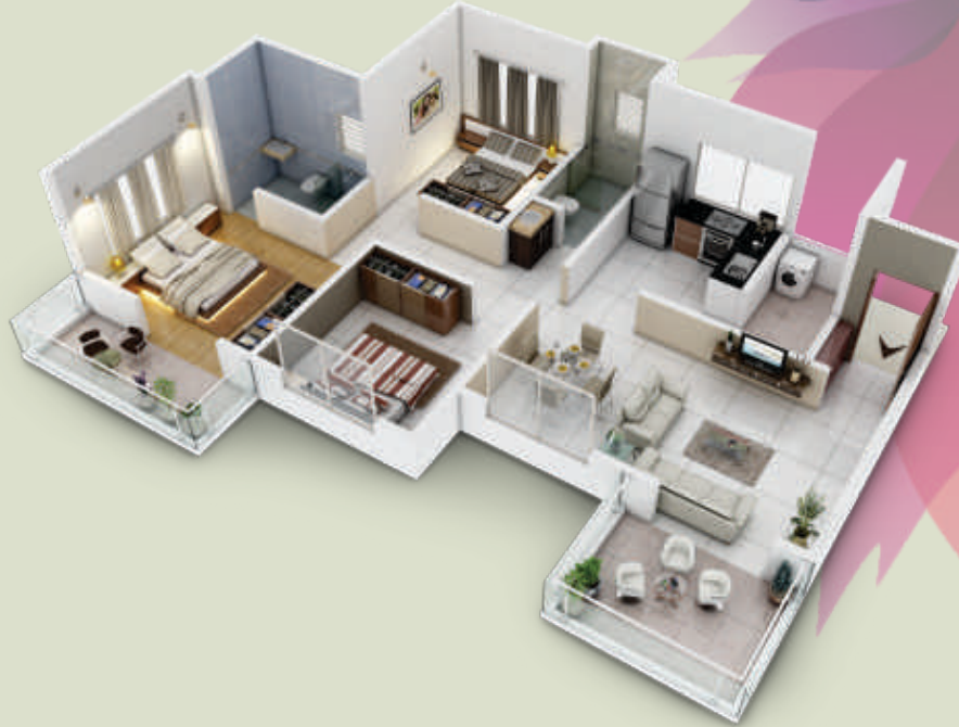
Identical 3 BHK Perspective View