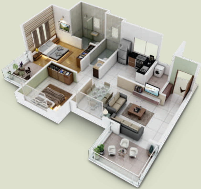
Identical 2 BHK Perspective View