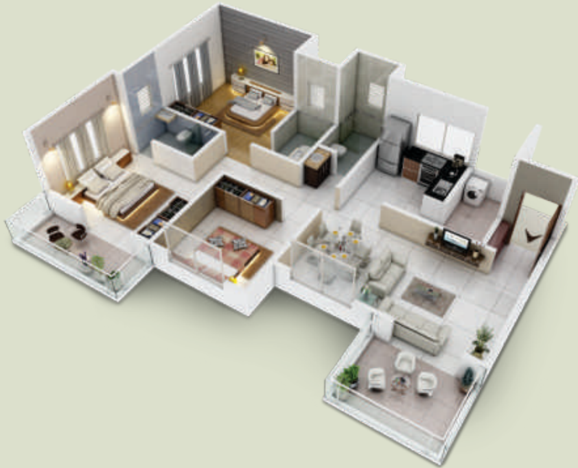
Identical 2.5 BHK Perspective View